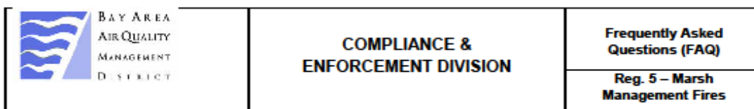
Exhibit 6: Frequently Asked Questions and Forms for a Marsh Burn Smoke Management Plan