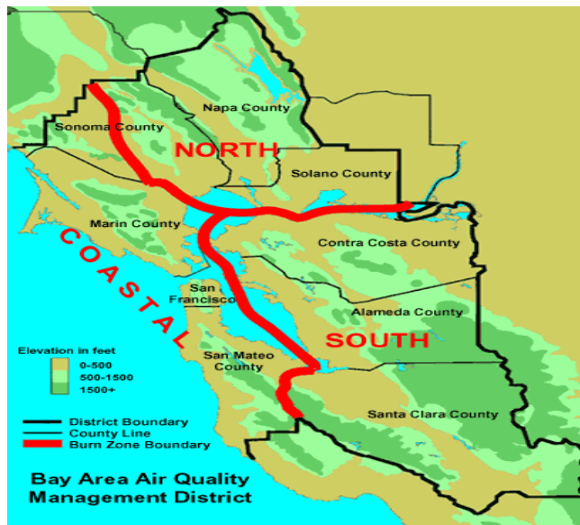
Figure 1. Bay Area Boundaries and Burn Zones